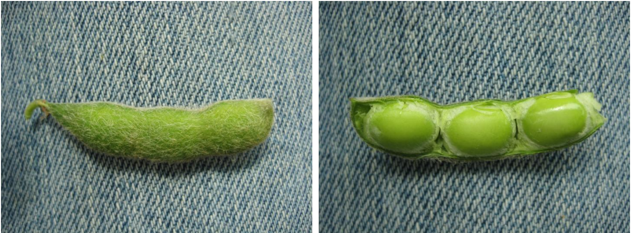
Figure 2. Soybean at R6 (full seed). Seeds filling the pod capacity in one pod at top 4 nodes.