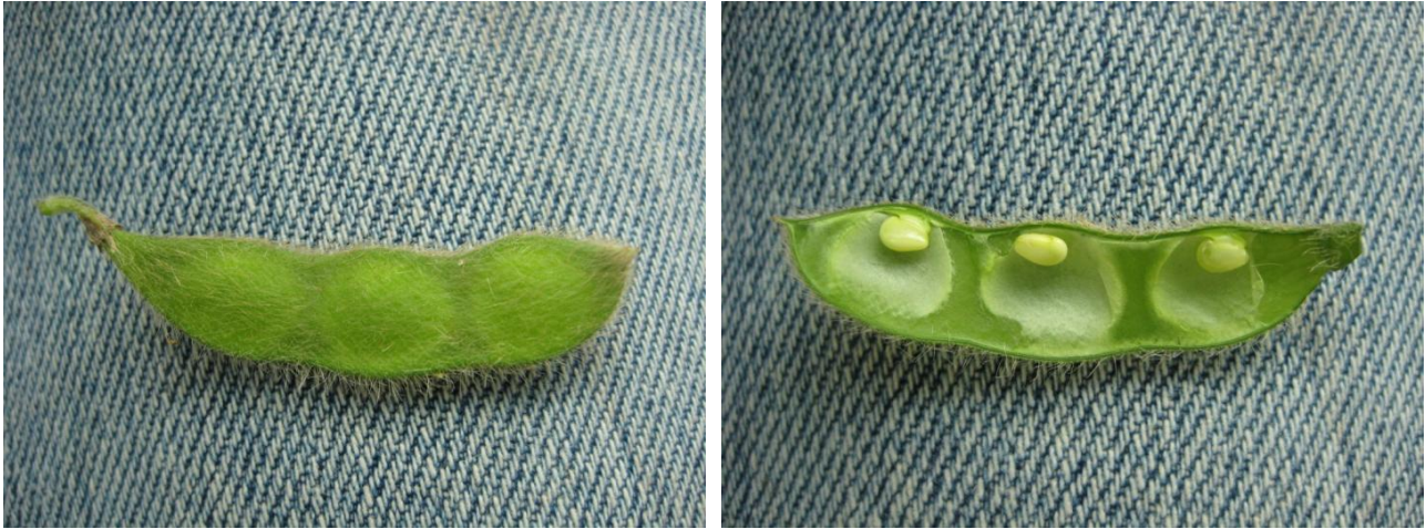
Figure 1. Soybean at R5 (first seed). Seeds are 1/8" long in one of the pods at the top 4 nodes.